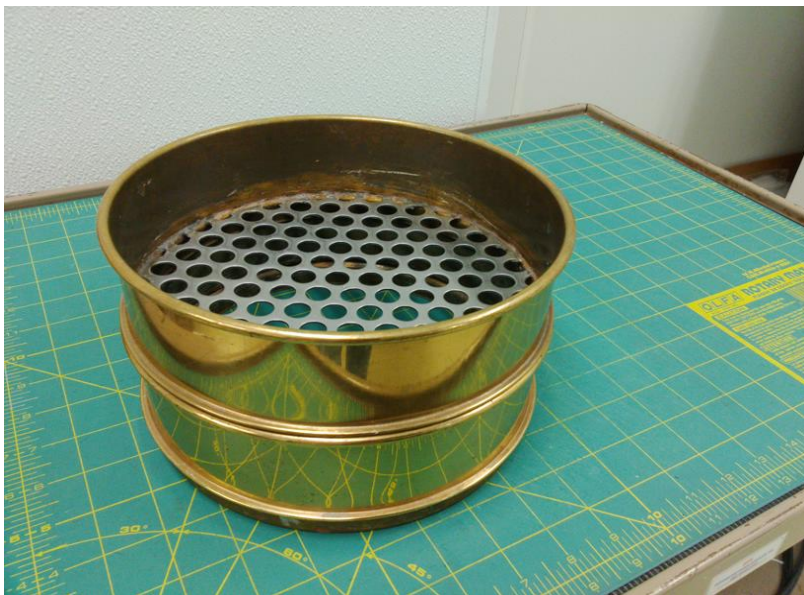
Sieve with spacer.