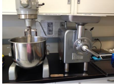
Examples of Equipment Hobart Mixer (image left) Hobart 4812 Grinder/Stuffer (image right)